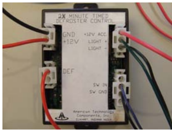
Defrost Timer Control Box