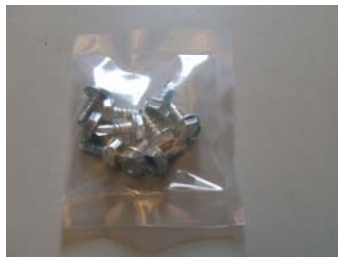
Self Tapping Screws