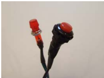
Indicator Light Push Button Switch